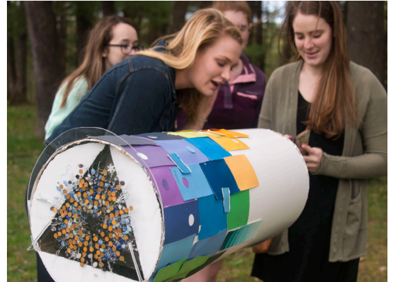
Kaleidoscope by Zoe Villane and Nate Massari