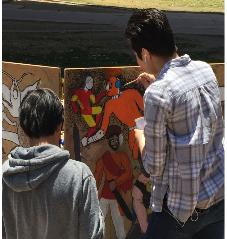
Comic Mythology Mural