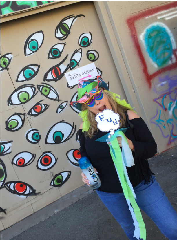
Beautification, Creation and Communication Station