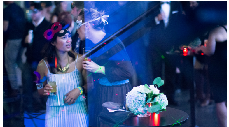
FIGMENT Masquerade Ball

By November 8, 2017 (before our final event of the season in Phoenix) FIGMENT had hosted 61 free interactive arts events in 18 cities, in 5 countries, on 4 continents—and we continue to grow and expand. To celebrate that fact, and to help alleviate the significant strain on our finances, the FIGMENT Global team and Board of Directors held its first-ever fundraiser filled with friends, art, a silent auction and raffle, and wonderful performances. A successful stab at a high(er)-end event for our advocates and champions, we’re aiming to hold another in 2018!