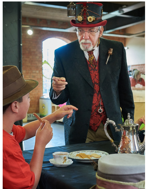
Tea Duelling by Brigadier Bounder