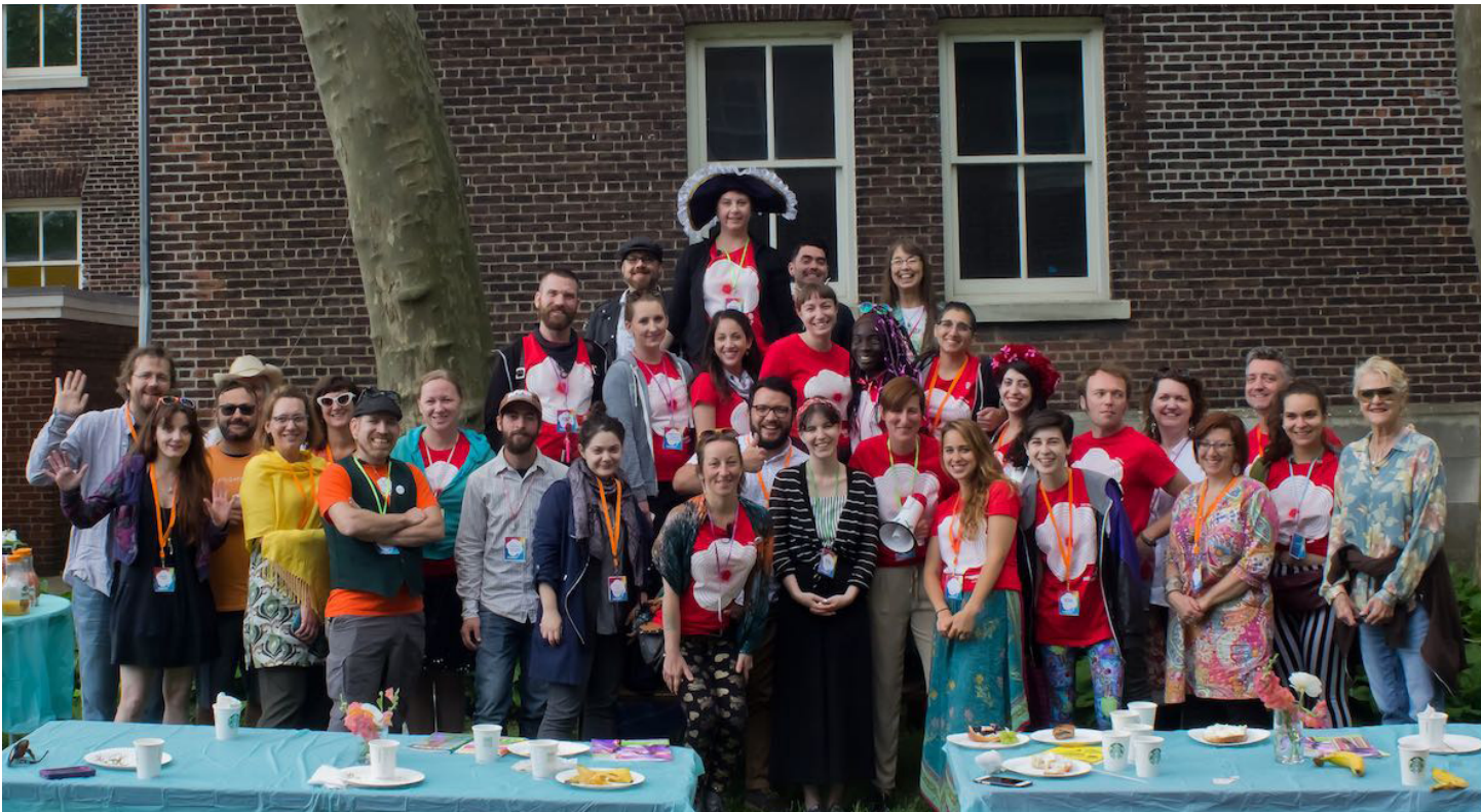
2017 Producers Brunch at FIGMENT NYC