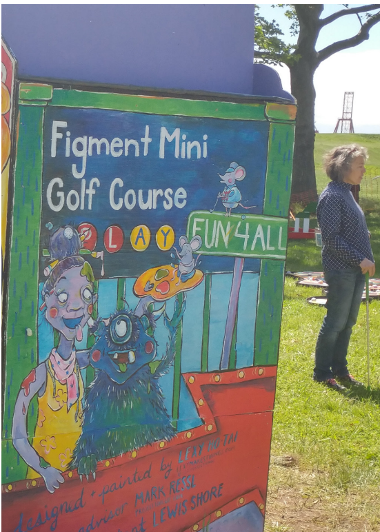
Minigolf Hole 3: Honk Honk! Beeeeeep! Get out of my way! It's SHOOOWWWTIME! by Lexy Ho-Tai