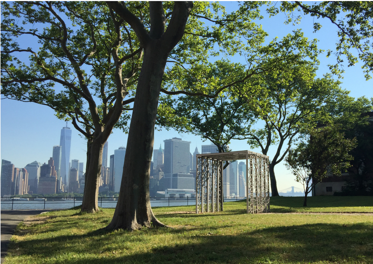
Cast & Place by Team Aesop, 2017 City of Dreams Pavilion, FIGMENT NYC