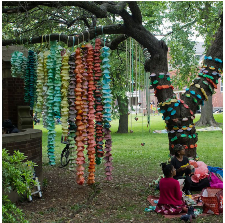
Kindle by Claire Breidenbach