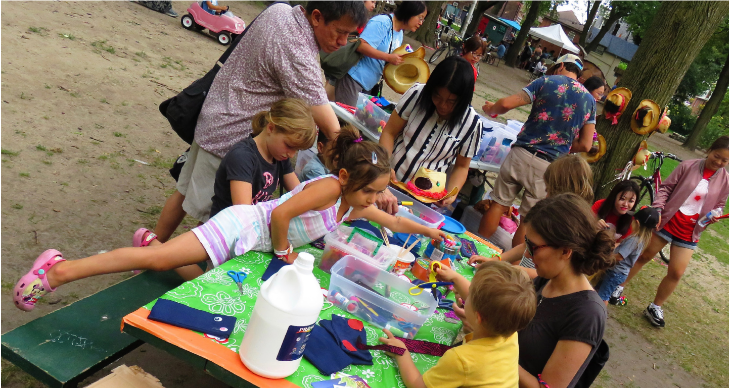
Style Your Hat by The Rox Zone

For its 5th annual event, on August 19, 2017, FIGMENT Toronto changed venues from Olympic Island to the Toronto mainland, in Dufferin Grove Park—a move that paid off beautifully. The team's relationship with the city is strong as ever, as is their consistent grant support from the Government of Canada. Opting for a smaller, one-day event this year with 23 registered projects helped the team find their footing on this new location; they plan to revisit the park in 2018.