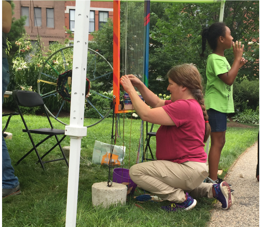
Community Threads by Saphron Rey