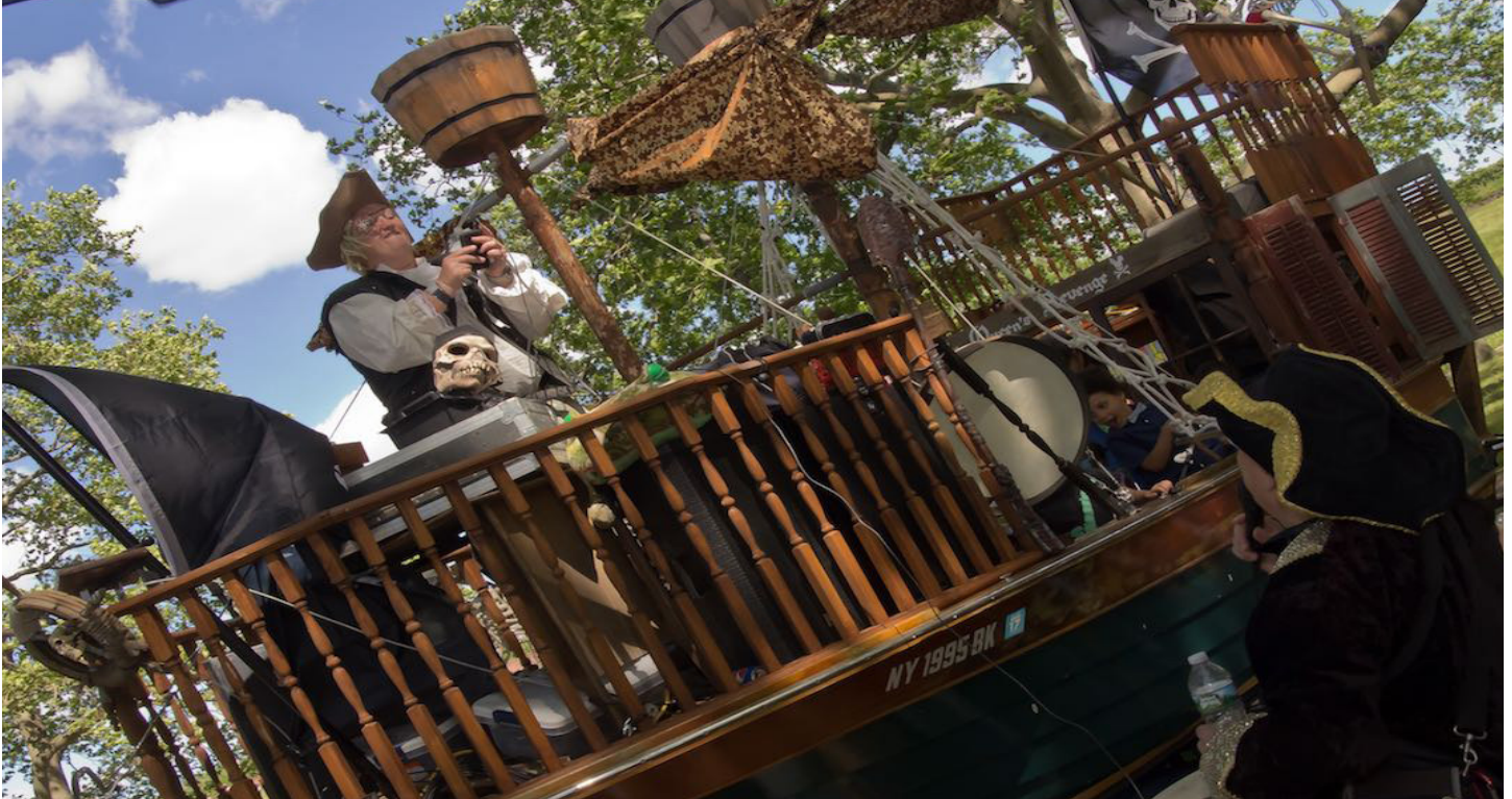
Pirate Ship by Kimmy Dudek

FIGMENT NYC 2017: FIGMENT NYC's 11th annual event on June 3-4, 2017, was held in tighter quarters, due to the redevelopment of Governors Island, specifically the Parade Ground that often houses the event's large-scale and summer-long projects. With the introduction of Dream Bigger, a special call for art for high-impact projects at FIGMENT NYC, the NYC event is reinventing itself as it moves into its second decade.