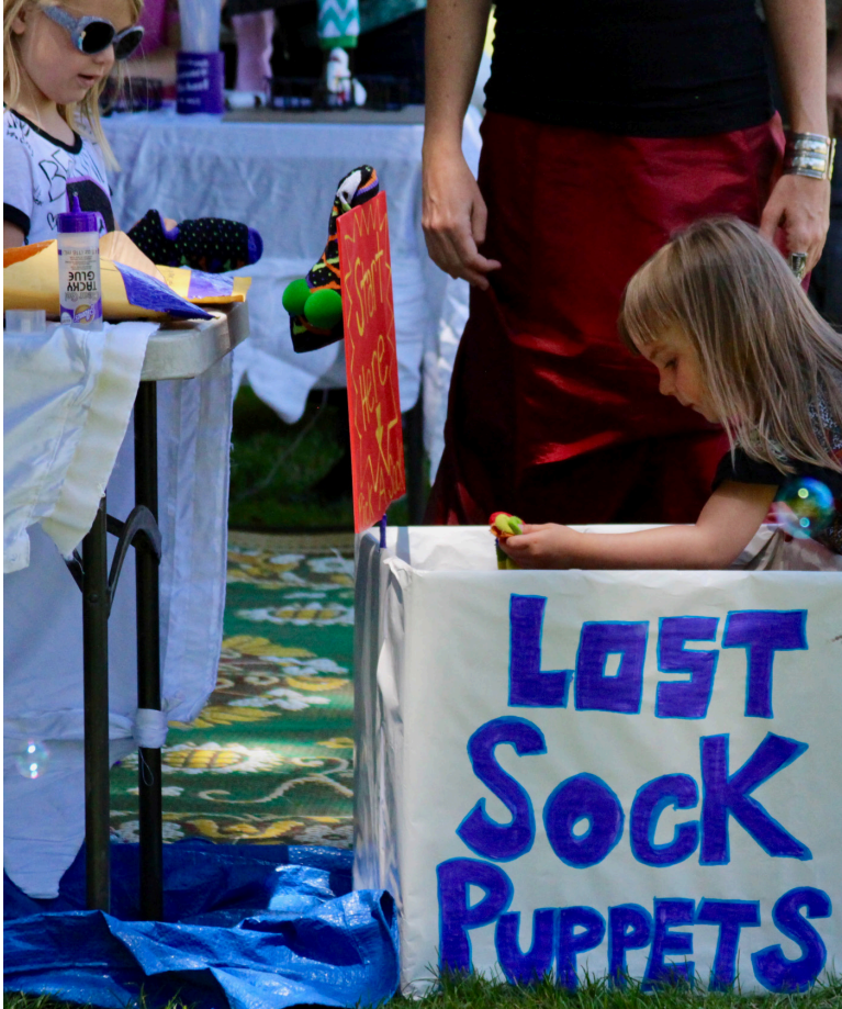
Lost Sock Puppets by Paisley's Puppets