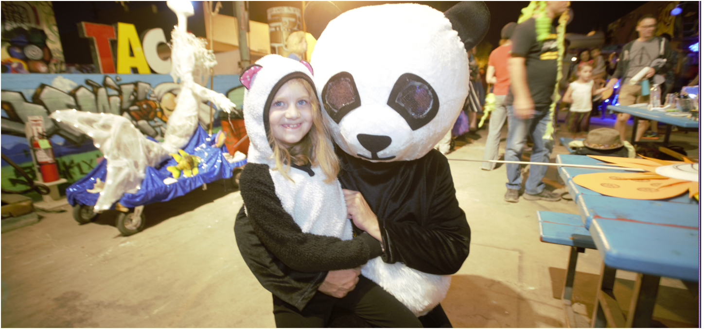
Eucalyptus Ensemble

Our first-ever FIGMENT in the Southwest took place in Phoenix on November 11, 2017, filling The Unexpected Art Gallery with music, color and creativity. Highlights included a fashion show of outfits made from recyclable materials and a parade that ended the Grand Avenue Festival. Throughout the year leading up to FIGMENT, the team successfully activated spaces in Mesa and Phoenix, partnering with established arts organizations such as the Mesa Art Center, Grand Avenue Preservation Association, and the Participatory Arts Preservation Association (PAPA).