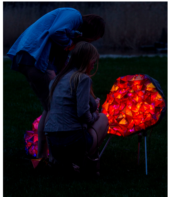
Field of Dreams by Beth Reitmeyer with ELEL