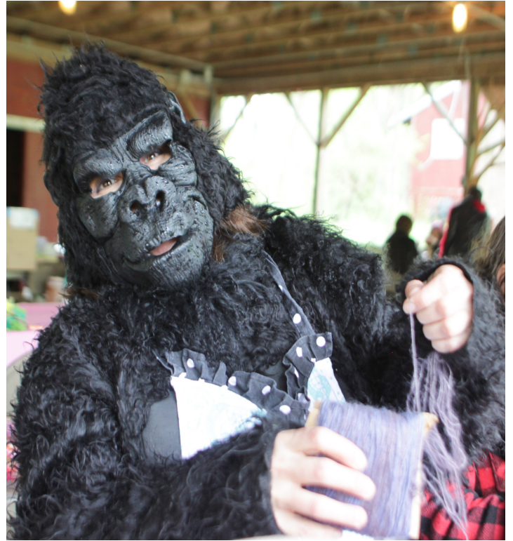
Make a Stinky by Deborah