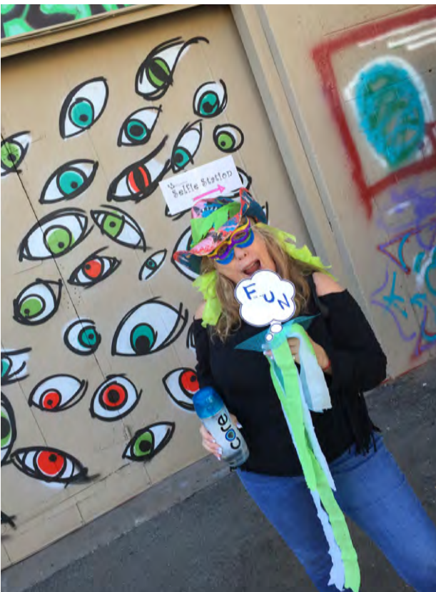
Beautification, Creation and Communication Station / Photo © 2017 Erin Magorian