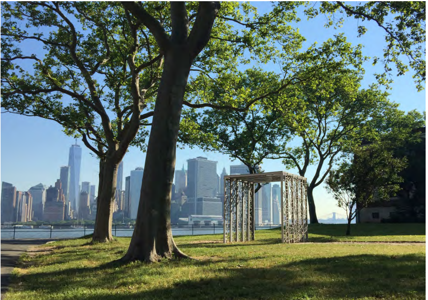
Cast & Place by Team Aesop, 2017 City of Dreams Pavilion, FIGMENT NYC