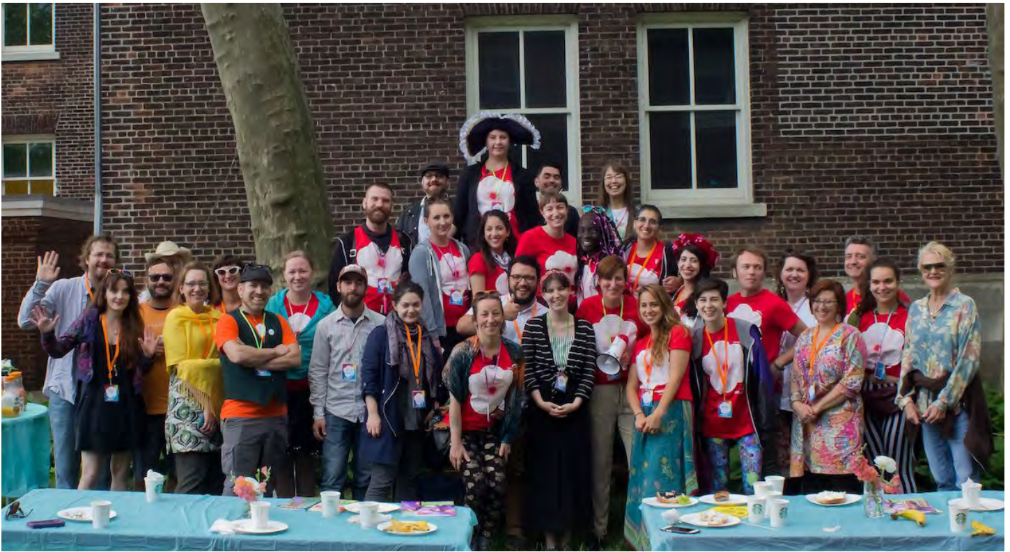
2017 Producers Brunch at FIGMENT NYC / Photo © 2017 Daniel Rose