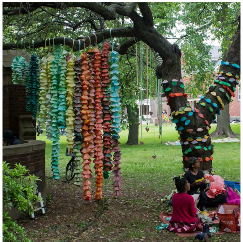
Kindle by Claire Breidenbach