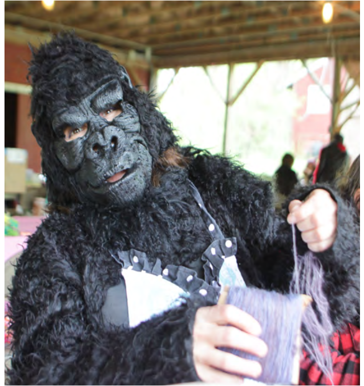
Make a Stinky by Deborah