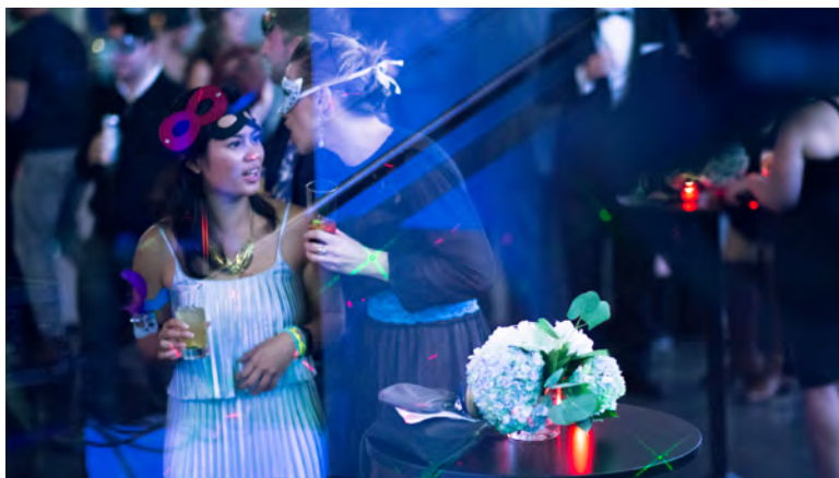
FIGMENT Masquerade Ball

By November 8, 2017 (before our final event of the season in Phoenix) FIGMENT had hosted 61 free interactive arts events in 18 cities, in 5 countries, on 4 continents—and we continue to grow and expand. To celebrate that fact, and to help alleviate the significant strain on our finances, the FIGMENT Global team and Board of Directors held its first-ever fundraiser filled with friends, art, a silent auction and raffle, and wonderful performances. A successful stab at a high(er)-end event for our advocates and champions, we’re aiming to hold another in 2018!