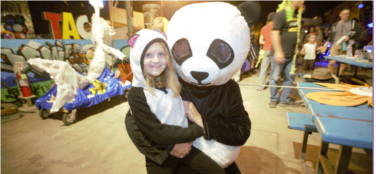
Eucalyptus Ensemble

Our first-ever FIGMENT in the Southwest took place in Phoenix on November 11, 2017, filling The Unexpected Art Gallery with music, color and creativity. Highlights included a fashion show of outfits made from recyclable materials and a parade that ended the Grand Avenue Festival. Throughout the year leading up to FIGMENT, the team successfully activated spaces in Mesa and Phoenix, partnering with established arts organizations such as the Mesa Art Center, Grand Avenue Preservation Association, and the Participatory Arts Preservation Association (PAPA).