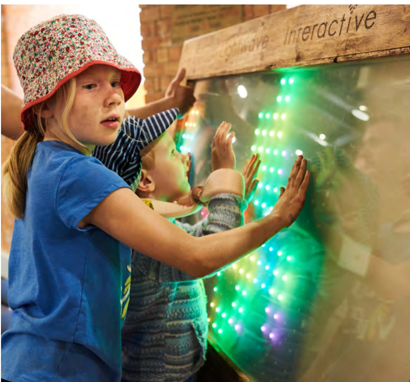
Lightwave Interactive by Robert Wilkes