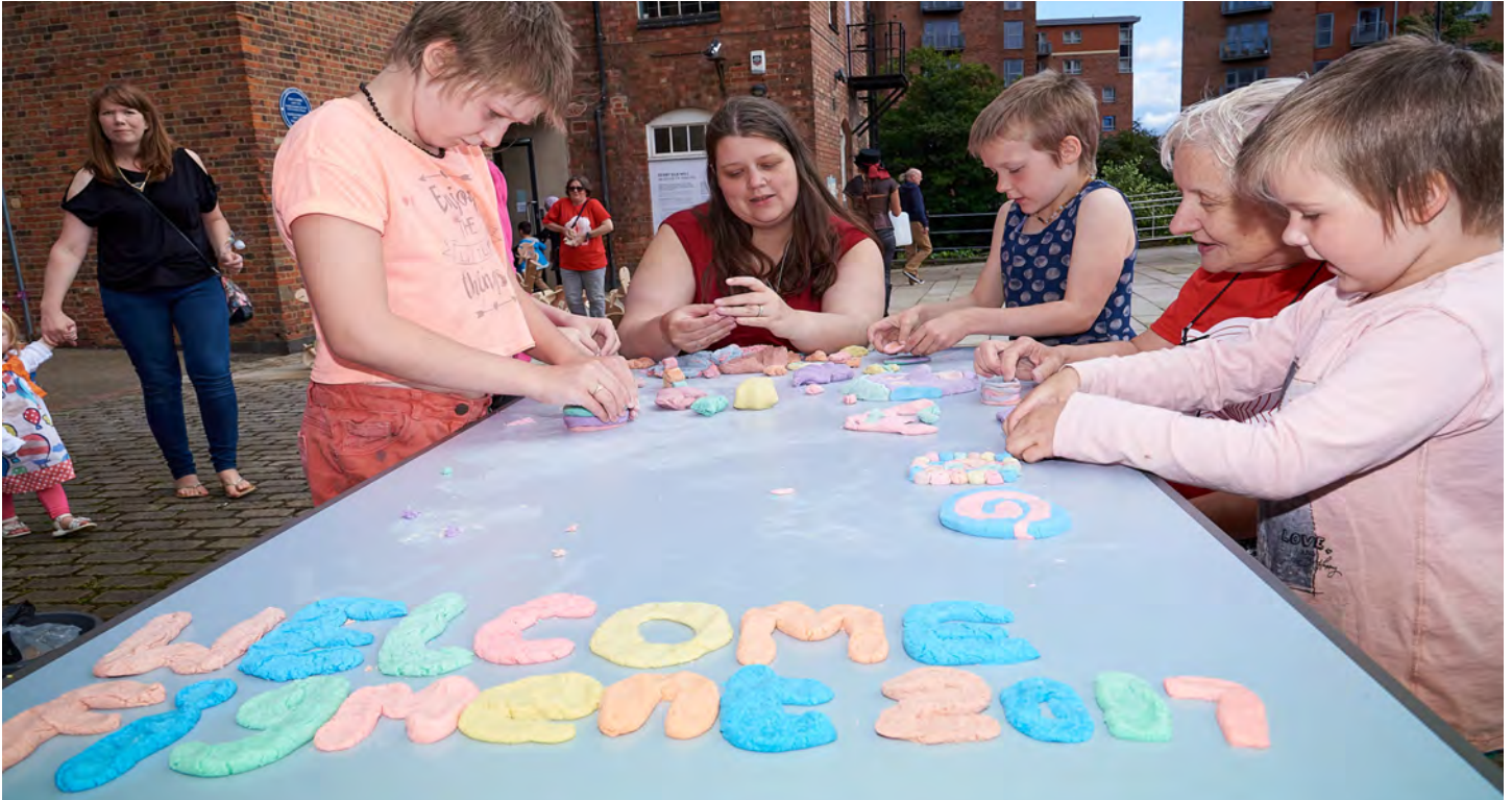
Plasticine Pit

FIGMENT returned to Derby, UK for its second event on August 19, 2017, on the lawn and square outside the Derby Silk Mill (the site of the world's first factory), and inside the Silk Mill's Project Lab. Over the course of the day about 500 people interacted with about 15 registered projects in total. FIGMENT Derby is funded through the Derby Silk Mill Museum as part of their programming; it is run by a team of volunteers and supported by Silk Mill staff on the day of the event.