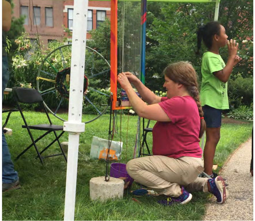
Community Threads by Saphron Rey