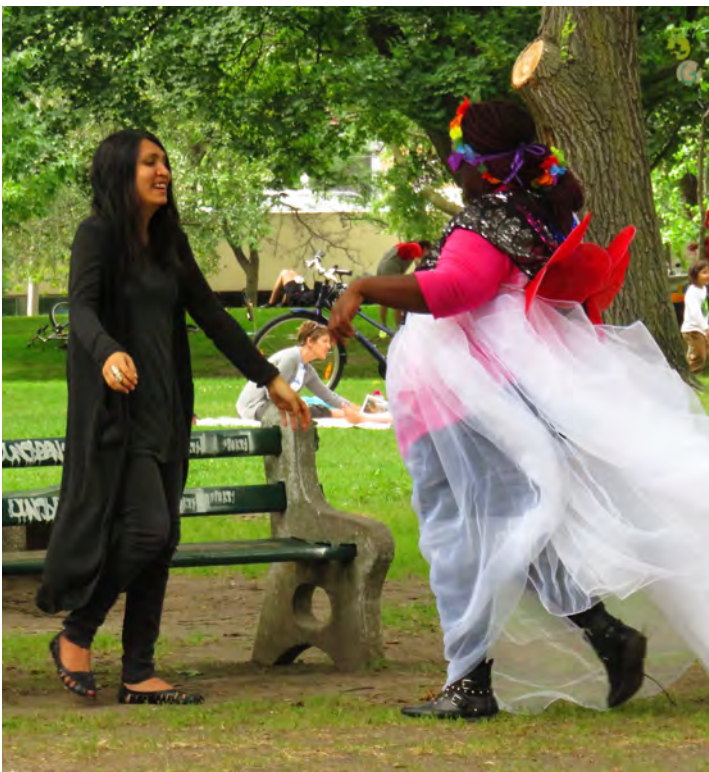
Fairy Greeter