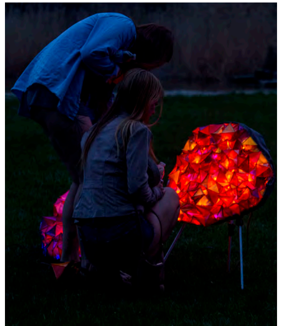
Field of Dreams by Beth Reitmeyer with ELEL