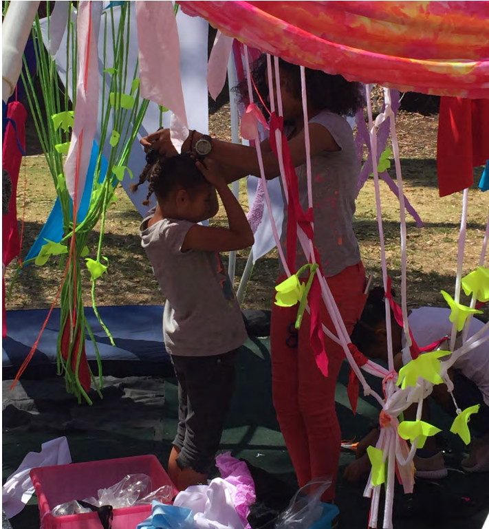
Webbed World by Lucy Boyd-Wilson

Now in its 5th year, FIGMENT San Diego is small but mighty. For their wooden anniversary event on May 13, 2017, there were around 25 projects, close to 30 volunteers, put together by a tiny but dedicated team. The star of San Diego's FIGMENT is always Chicano Park, and after some first year challenges, the event has now fully integrated itself into the park's regular summer programming schedule.