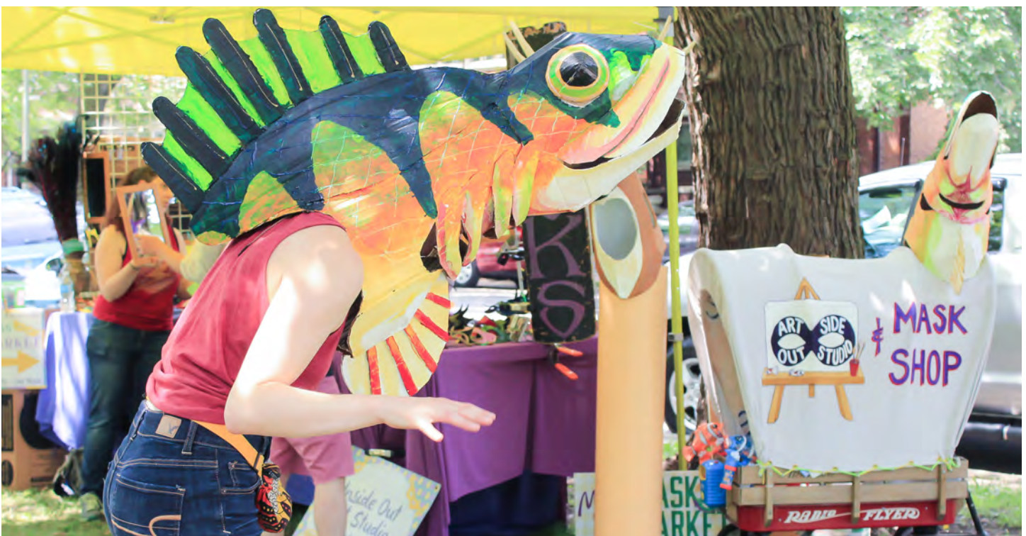
Art Side Out Studio and Mask Shop by Jeff Semmerling