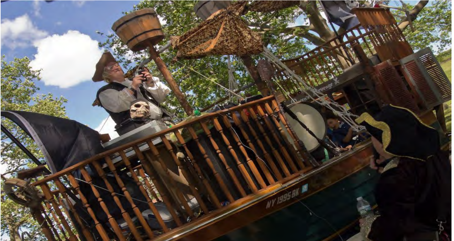
Pirate Ship by Kimmy Dudek

FIGMENT NYC 2017: FIGMENT NYC's 11th annual event on June 3-4, 2017, was held in tighter quarters, due to the redevelopment of Governors Island, specifically the Parade Ground that often houses the event's large-scale and summer-long projects. With the introduction of Dream Bigger, a special call for art for high-impact projects at FIGMENT NYC, the NYC event is reinventing itself as it moves into its second decade.