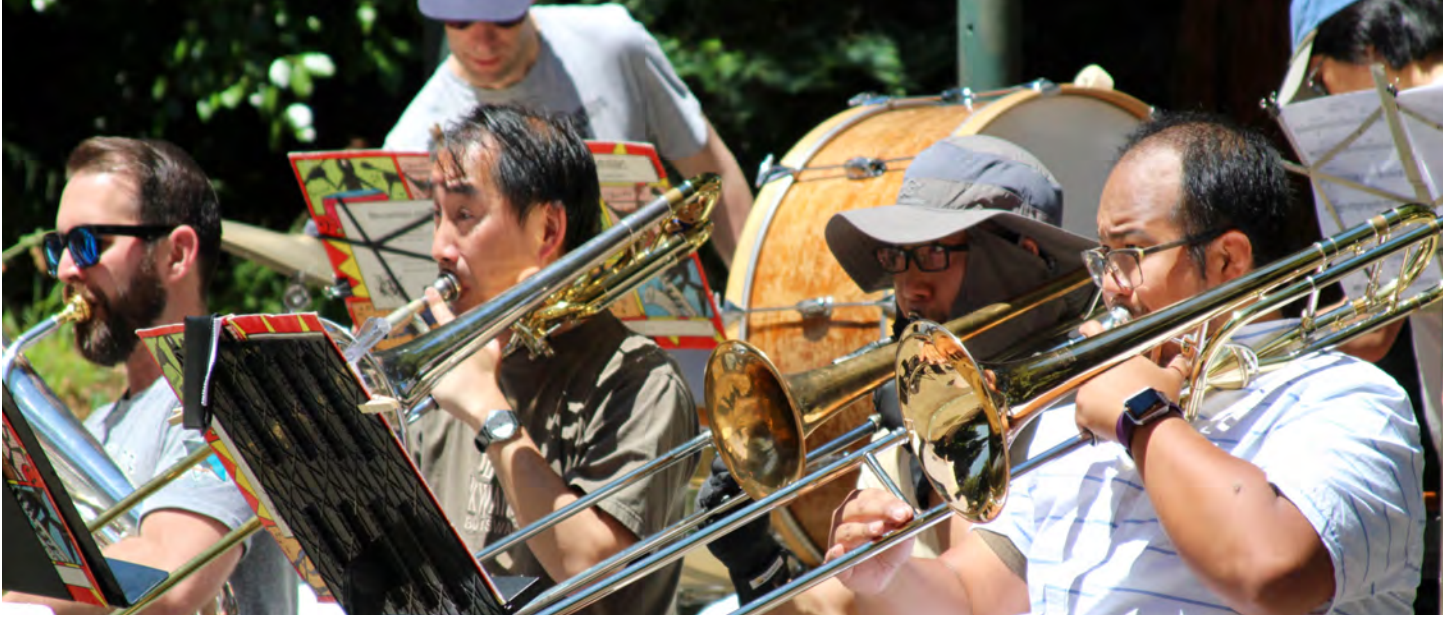
Awesome Orchestra Collective

FIGMENT Oakland's third event (after running a children's arts education program in partnership with Oakland Parks, Recreation & Youth Development in the summer of 2016) returned to its beautiful home at Mosswood Park on June 10, 2017. A high-traffic area, perfect weather, and a central location led to over 600 people coming together to create and engage with over 30 projects.