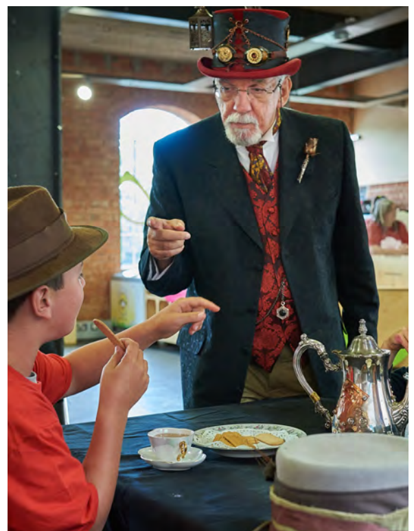
Tea Duelling by Brigadier Bounder