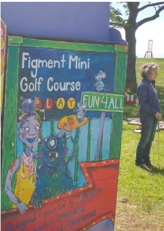
Minigolf Hole 3: Honk Honk! Beeeeeep! Get out of my way! It's SHOOOWWWTIME! by Lexy Ho-Tai