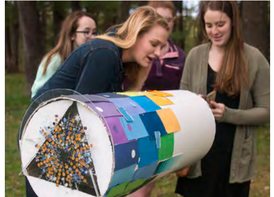
Kaleidoscope by Zoe Villane and Nate Massari