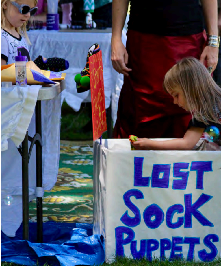
Lost Sock Puppets by Paisley's Puppets