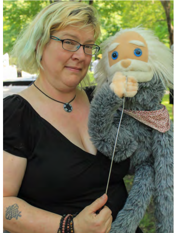
Mobile Puppet Theatre Cart by Andrea North