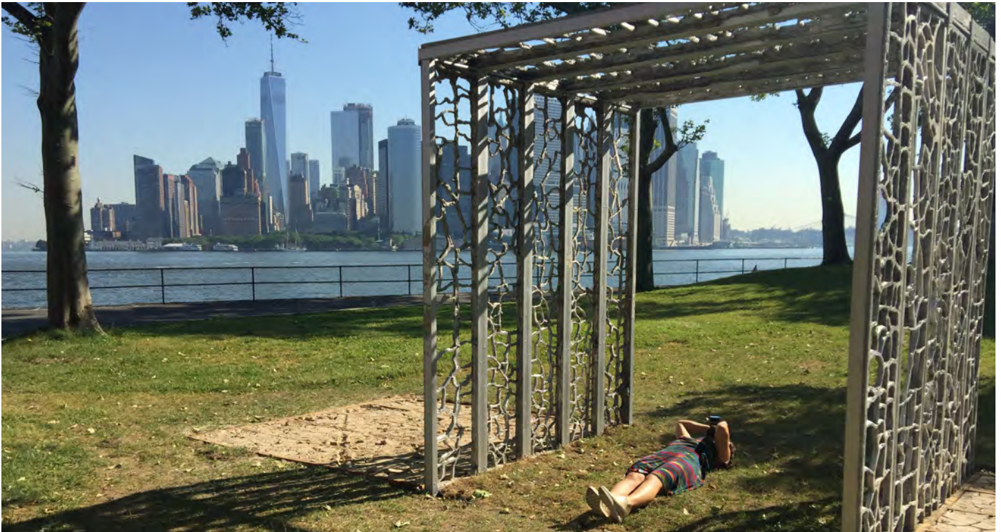
Cast & Place by Team Aesop

Summer-Long Projects: The NYC summer program saw the return of the City of Dreams Pavilion; this year's competition winner was Cast & Place by Team Aesop. FIGMENT NYC also celebrated the 10th anniversary of a long-time Governors Island favorite, our curated artist-designed minigolf course—this year's designs relating to the sounds of New York City and its music scene of the past, present or future.