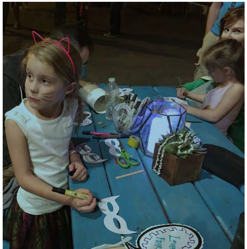
Beautification Station