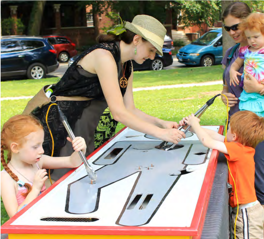
Emergency Game by Neil Verplank / Photo © 2017 Clare Densmore and Joseph Nowicki

For their fourth event, FIGMENT Chicago settled into Palmer Square Park on July 15, 2017. Eclectic live music drew in around 2,500 people of all ages, actively participating in the various art projects. Local community members were excited to engage with all projects during the event and the participating artists enjoyed the opportunity to freely share their unique form of creativity at this fun day.