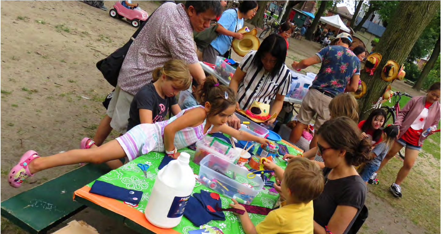
Style Your Hat by The Rox Zone

For its 5th annual event, on August 19, 2017, FIGMENT Toronto changed venues from Olympic Island to the Toronto mainland, in Dufferin Grove Park—a move that paid off beautifully. The team's relationship with the city is strong as ever, as is their consistent grant support from the Government of Canada. Opting for a smaller, one-day event this year with 23 registered projects helped the team find their footing on this new location; they plan to revisit the park in 2018.