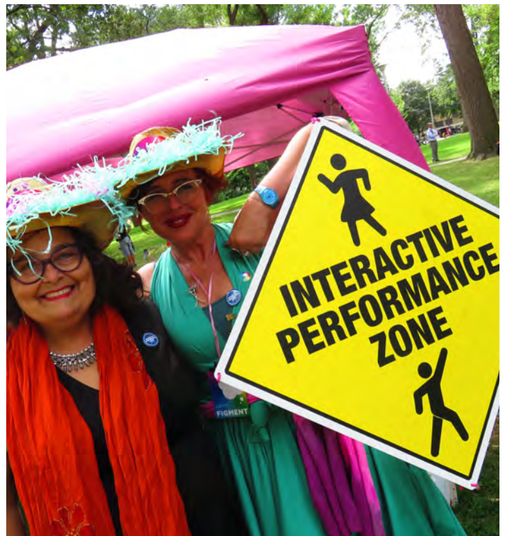
Interactive Performance Zone